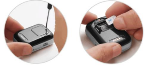
1. Open the sim card slot with tool

As shown on the image - sim contacts down. Ensure to close the latch tightly'. Use the included screwdriver & cover plate. Switch 'ON' the tracker via the power button